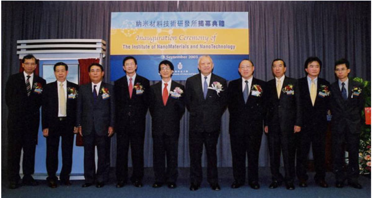
Photos of the Inauguration Ceremony of the Institute of NanoMaterials and NanoTechnology (INMT) on 5th Sept 2003